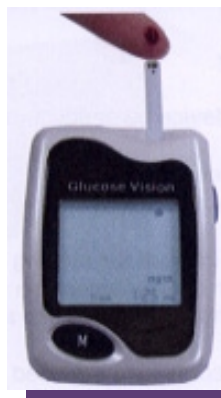
2. Apply Blood to Test Spot