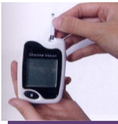
1. Insert Test Strip